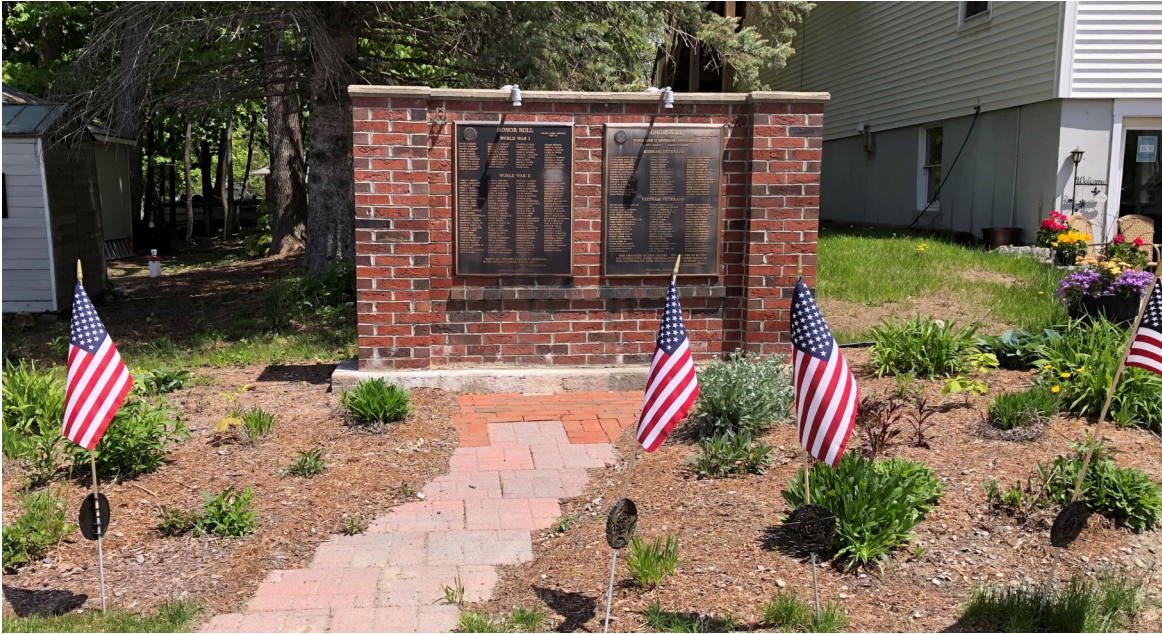
The veterans memorial on Main Street in the Village. It has the names of all town residents who served in the armed forces through 1972.