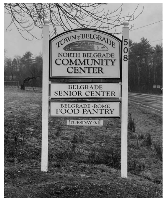
Belgrade's new "Senior Center Sign"

It is important to our community to provide programs and resources to help our seniors live well by keeping them active both mentally and physically. Doing so helps support independent living, which is vital for those who want to age in place in their homes.